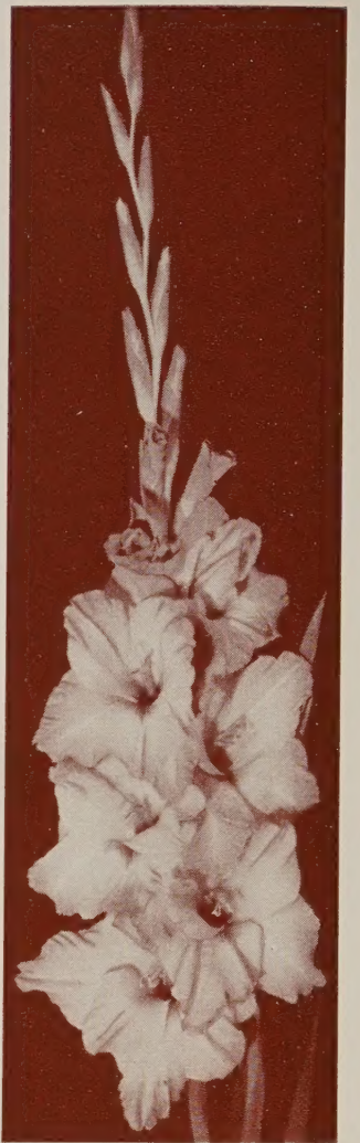
ELIZABETH THE QUEEN